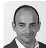
Oscar Gamazo Congreso de los Diputados