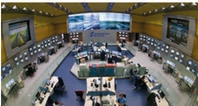
DGT The General Directorate for Traffic of Spain

The theoretical programme is complemented by visits to the following entities, where participants will be able to observe directly some of the topics dealt with in the theoretical sessions. The programmed visits are an important support to the teaching carried out in the classroom, as they permit the student to see the work in Spain of some of the entities referenced, the technology, the methods and processes that are used in each case. Each visit has been scheduled according to the training programmed, with the following visits planned: