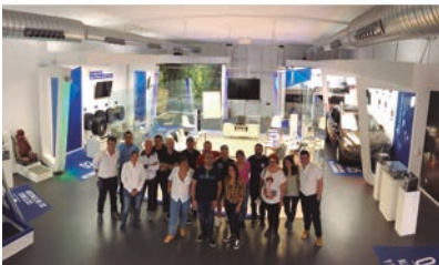
Jarama - RACE RACE Driving School Course