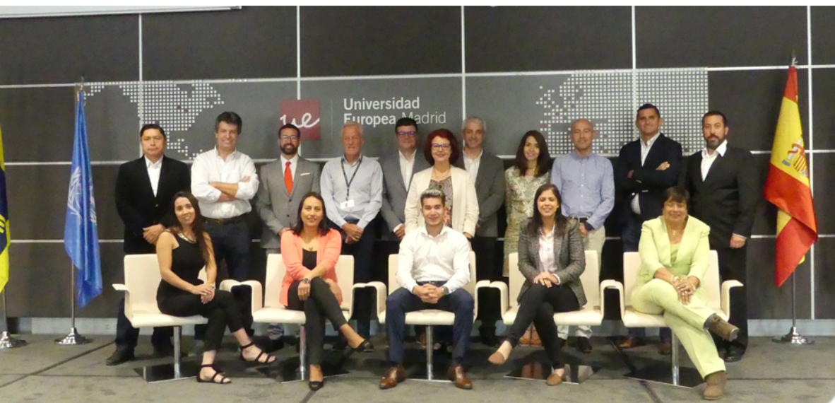
2nd promotion Alumni