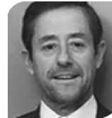
Roberto Llamas Ministerio de Formento