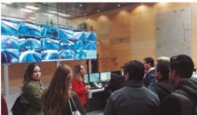
Madrid M-30 Tunnels Operation center