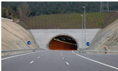
AP-6 tunnel Guadarrama tunnel AP-6 Villalba-Adanero