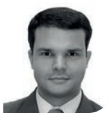
Enrique Miralles AEC