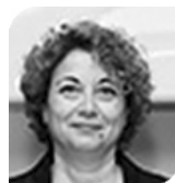
Victoria de la Orden Seguridad Vial Laboral