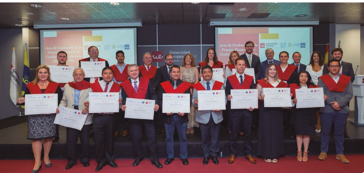
1st promotion Alumni